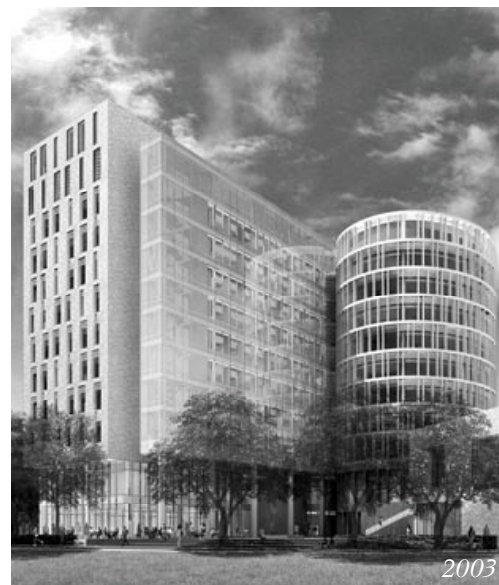
1997: Rice’s Department of Bioengineering is founded and becomes one of the top ten programs in the country within a decade. 2003: Rice joins the Texas Medical Center. Three years later, Rice begins construction on the Collaborative Research Center to deepen partnerships between Rice and the TMC. 2007: Rice’s Center for Biological and Environmental Nanotechnology develops Nanorust, a revolutionary, low-cost technology for cleaning arsenic from drinking water.