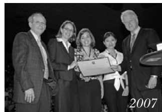
2003: Rice founds an Engineers Without Borders charter and begins sending engineering students to countries such as El Salvador, Mali, Mexico and Nicaragua. 2003: Rice’s baseball team wins the NCAA championship. 2004: The Shepherd School of Music is invited to participate in the prestigious Conservatory Project. 2004: The Passport to Houston program is established to grant students free or discounted admission to cultural arts venues and free access to public transportation. 2006: Rice launches the Center for Civic Engagement. 2007: Rice unveils “Rice 360°: Technology Solutions for World Health,” a $100 million initiative that builds on the successful Beyond Traditional Borders program to engage Rice students in developing global health technology.