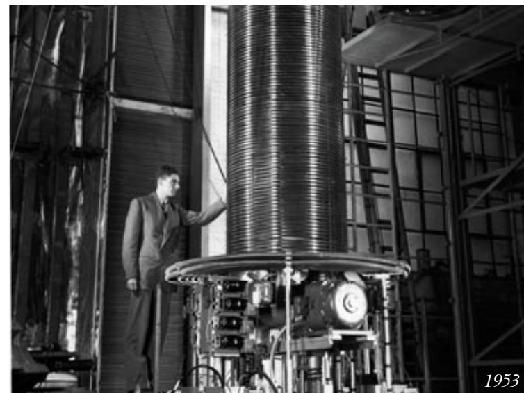
1937/1953: Rice physicists begin work on a 2.5-million-volt atom bombardment machine with which they will study atomic nuclei. Sixteen years later, Rice opens a lab for nuclear experimentation that includes a six-million-volt Van de Graaff particle accelerator. 1962: At Rice Stadium, President John F. Kennedy promises that the U. S. will send a man to the moon by the end of the decade. The following year, Rice becomes the first university to establish a space science department.